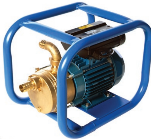
ENM25 in frame

These are good, general-purpose, portable pumps for circulating and transfer of water, sea-water, juices, gas oil ("red diesel"), bio-fuel, transformer oil and mild chemicals. However, THEY MUST NOT PUMP DERV ("white diesel"), petrol, solvents or products with a low flash point. All models are supplied free-standing, so for ease of handling and added protection, a full frame is a worthy investment as an optional extra.