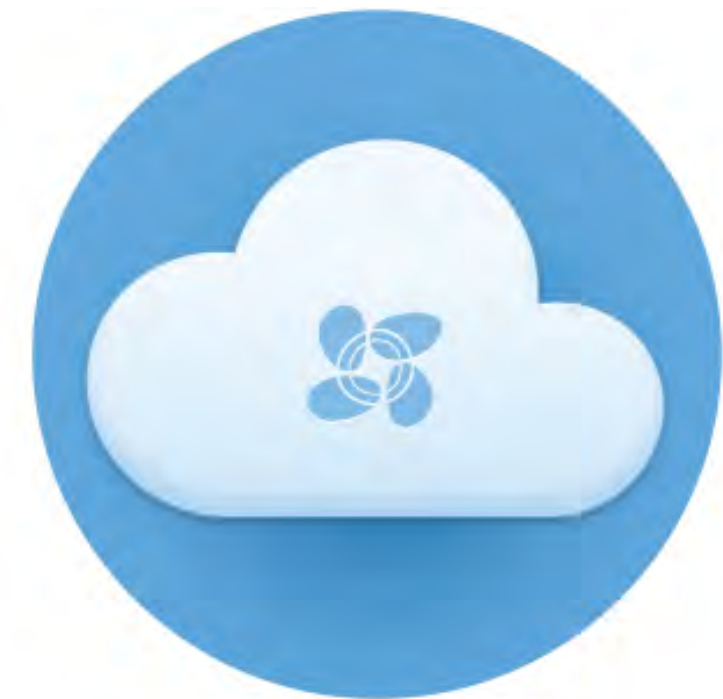
Encrypted Cloud Storage