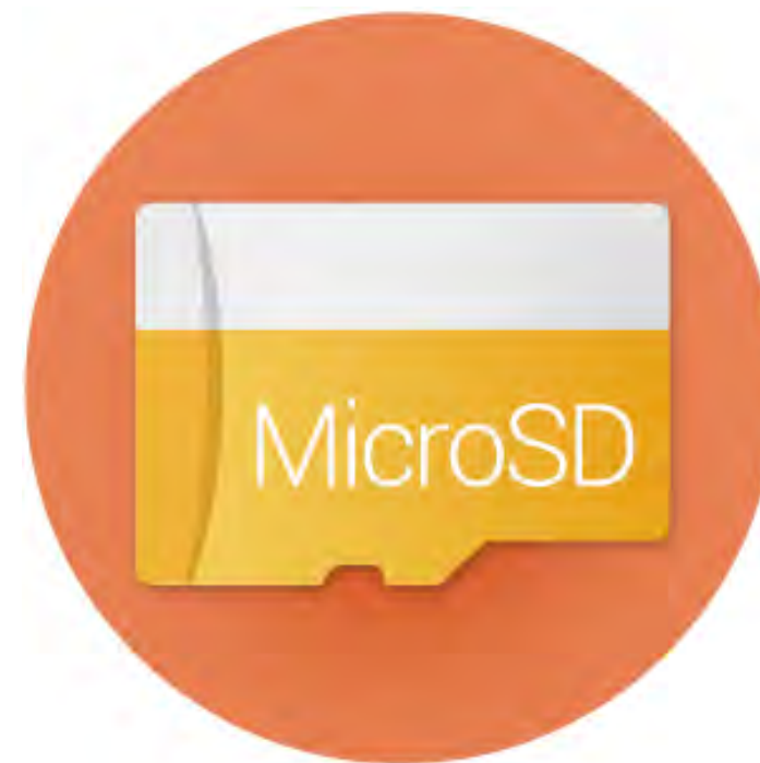
Built in SD Card

(EZVIZ cloud storage service is only available in the UK and US)