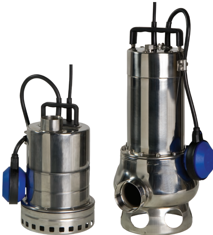
Mizar 60/S auto