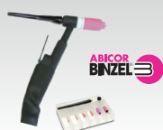
SR26L - 8 m 046184