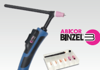
SR26DB - 8 m 038271