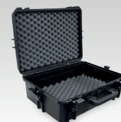
On-Site Case IP67 060432