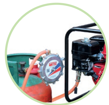
LPG conversion kit