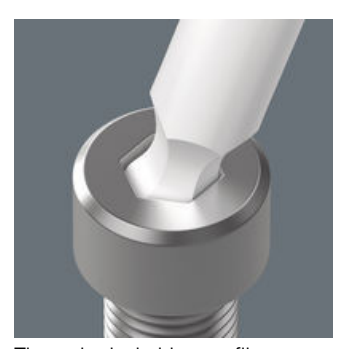
The spherical drive profile means that it is possible to swivel the axis of the tool to that of the screw, and therefore enable angled, "around-the-corner" screwdriving jobs.