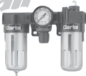
Filter/Regulator/Oiler Model : CMF2 & CMF3 Part No : 3090200 & 3090205